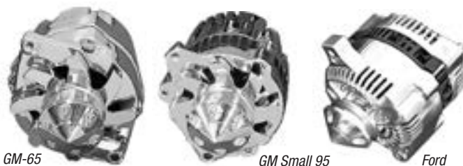
GM-65 GM Small 95 Ford