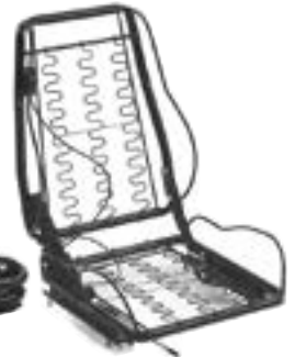
Universal Bucket Seat