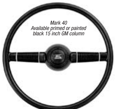
Mark 40 Available primed or painted black 15 inch GM column