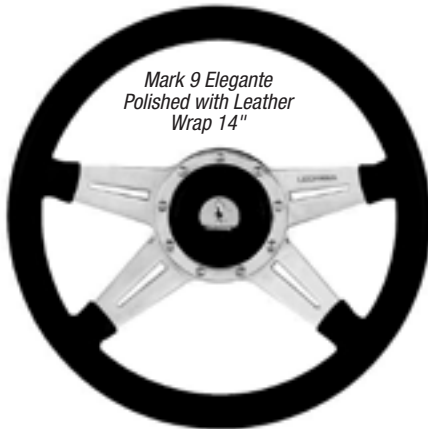
Mark 9 Elegante Polished with Leather Wrap 14"