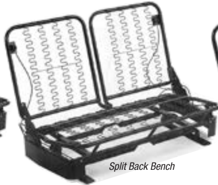
Split Back Bench