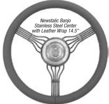
Newstalgic Banjo Stainless Steel Center with Leather Wrap 14.5"