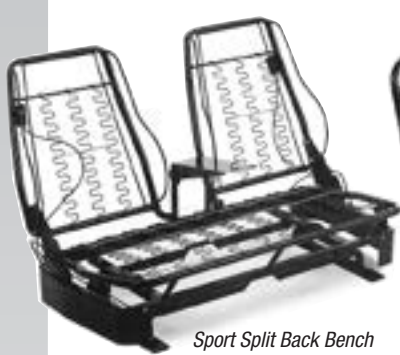
Sport Split Back Bench