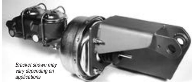
Bracket shown may vary depending on applications