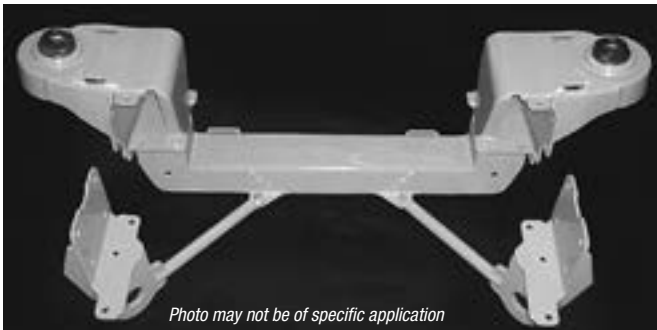
Photo may not be of specific application

COMPLETE CHASSIS with IFS Starting at $5,250.00 exchange