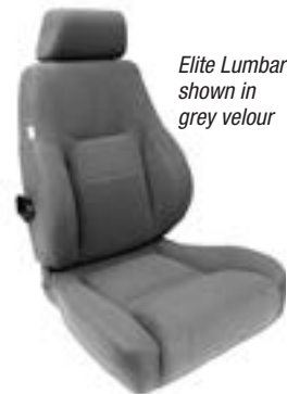
Elite Lumbar shown in grey velour