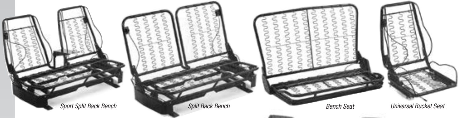
Sport Split Back Bench