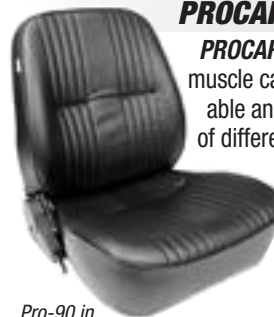
Pro-90 in black vinyl

PROCAR has seats to fit almost any hot rod, custom, muscle car or truck and designed to be safe, comfortable and supportive. Most are available in a number of different colors and materials. Bolt-in brackets are available for many applications.