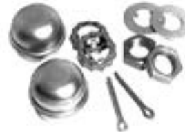
SPINDLE NUT KIT HK-006 ..... pair $15.95