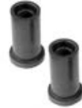
STEERING RACK BUSHINGS MP-012 ..... pair $22.00