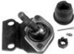
LOWER BALL JOINT MP-016 ..... each $29.95