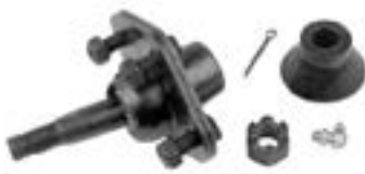
UPPER BALL JOINT MP-015 ..... each $29.00