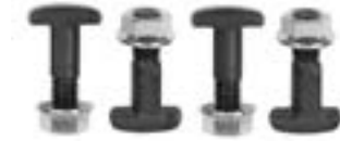
UPPER ARM BOLT KIT MP-001-A ..... $19.95