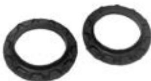
UPPER SPRING CUSHIONS MP-006 ..... pair $18.00