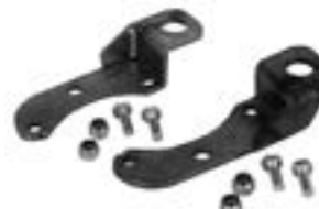
STABILIZER BAR BRACKET KIT Bracket kit bolts onto existing control arms, with an easy-to-use drill template, or bolts onto Heidt's control arms. Available in plain or polished stainless steel.