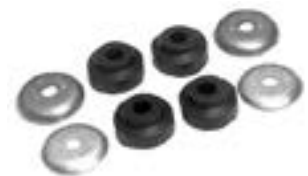
STRUT ROD BUSHING KIT MP-011 ..... pair $35.00