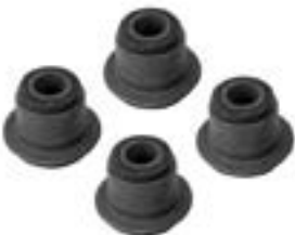
UPPER CONTROL ARM BUSHINGS MP-013 ..... pair $26.95