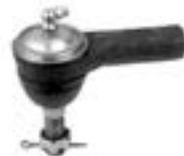
TIE ROD ENDS MP-017 ..... each $22.00