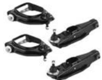
OEM STYLE CONTROL ARMS Upper and lower set . $299.00