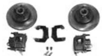
ECONOMY MUSTANG II DISC BRAKES 11" FORD ROTORS pair . $130.00 GM CALIPERS/ PINS/ PADS pair . . . . . $89.95 BRACKET KIT . . . . . $100.00