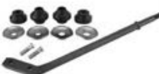
OEM STYLE STRUT RODS W/ BUSHINGS pair . . . . . $110.00