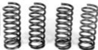
REPLACEMENT COIL SPRINGS These springs are shorter than stock. FS-8250 250 pound . . . $90.00 FS-8275 275 pound . . . $90.00 FS-8300 300 pound . . . $90.00 FS-8325 325 pound . . . $90.00 FS-8350 350 pound . . . $90.00 FS-8375 375 pound . . . $90.00