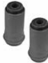
LOWER ARM BUSHINGS MP-014 ..... pair $22.00