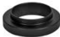
SPRING SPACERS Use these 3/4" thick spacers in place of your upper spring cushions to add just a little ride height back in your ride. Sold in pairs. MP-060 ..... $30.00