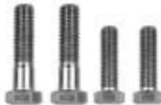
CALIPER BOLT KIT MP-002 ..... pair $16.00