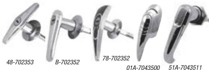
48-702353 B-702352 78-702352 01A-7043500 51A-7043511