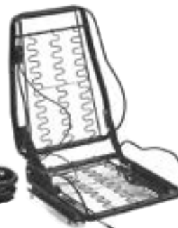
Universal Bucket Seat