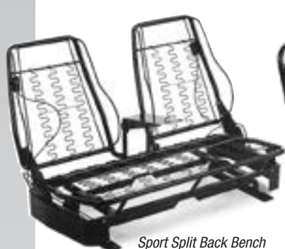
Sport Split Back Bench