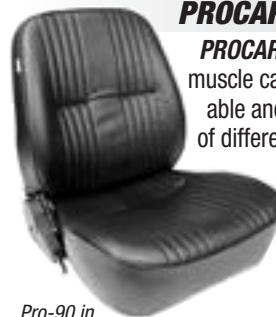
Pro-90 in black vinyl