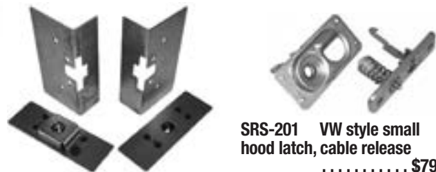
SRS-201 VW style small hood latch, cable release ..... $79.95