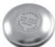
Original 1932-48 Gas Cap