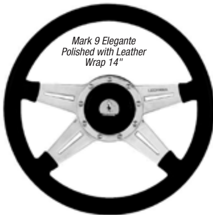
Mark 9 Elegante Polished with Leather Wrap 14"