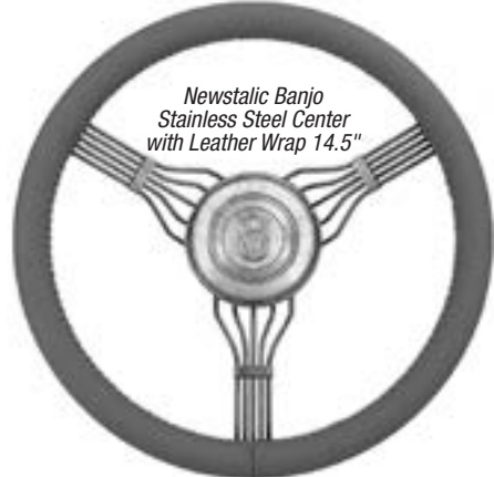
Newstalgic Banjo Stainless Steel Center with Leather Wrap 14.5"