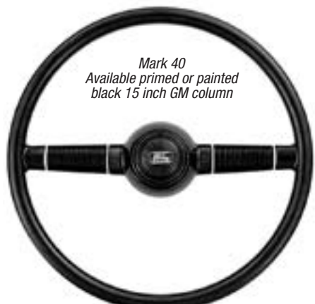
Mark 40 Available primed or painted black 15 inch GM column