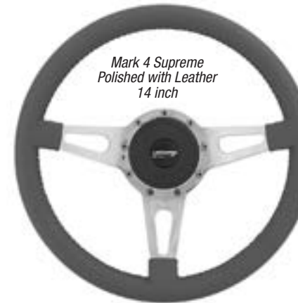
Mark 4 Supreme Polished with Leather 14 inch