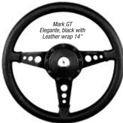
Mark GT Elegante, black with Leather wrap 14"